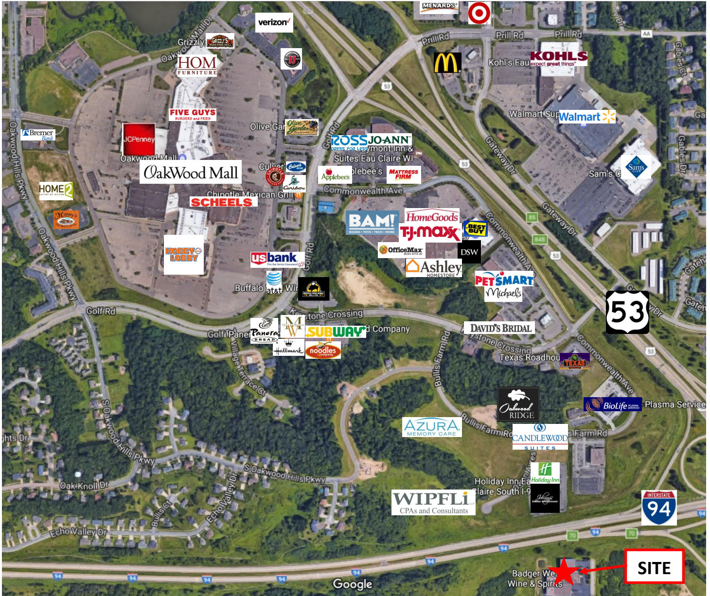
Google Maps, 2024