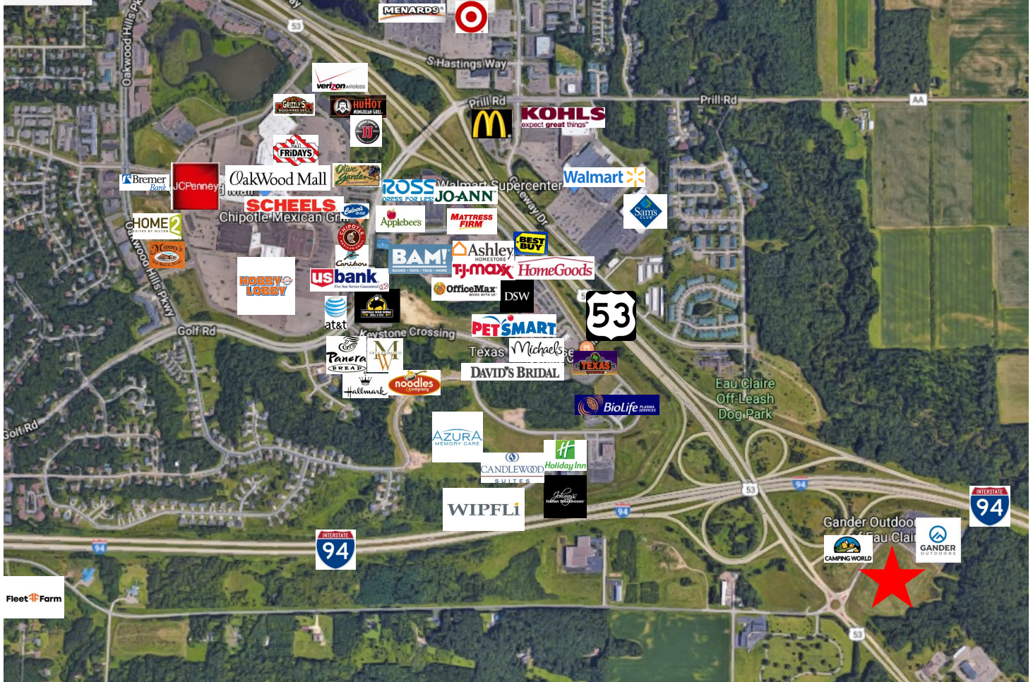
Google Maps, 2018